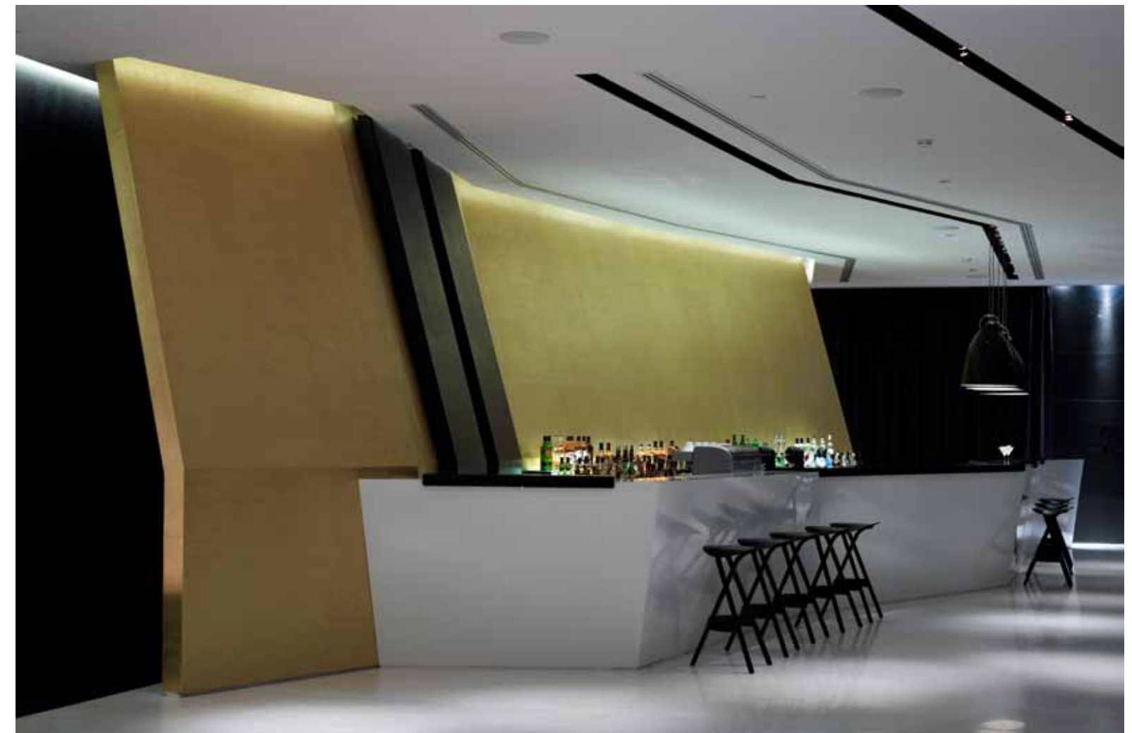
Opposite top Sivec white marble tiles create a high-gloss walkway underfoot.