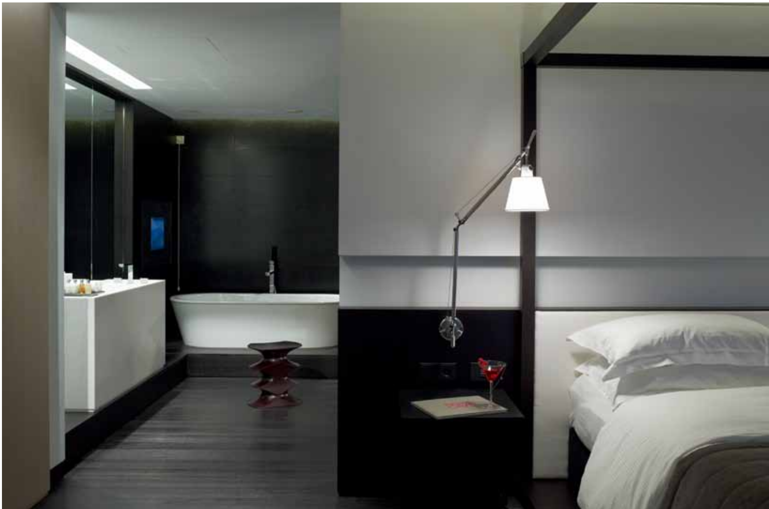
Contemporary furnishing and glass dividing walls are essential aspects of all the guest rooms.