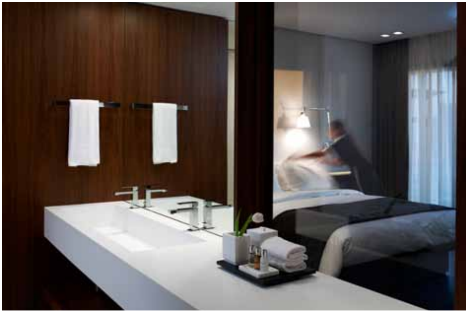
Opposite A relaxing vibe is imbued in the spa area.